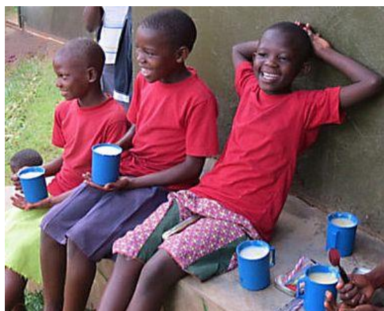
Children of Bududa

African Great lakes Peace Trust, Charity Commission reg 1154597